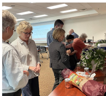
Silent auction for prizes.

It was such a privilege to be able to have our meeting in-person for 2023 and we are already looking forward to next year's meeting that is tentatively scheduled for Wednesday, April 17,