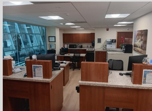
Credit Union interior